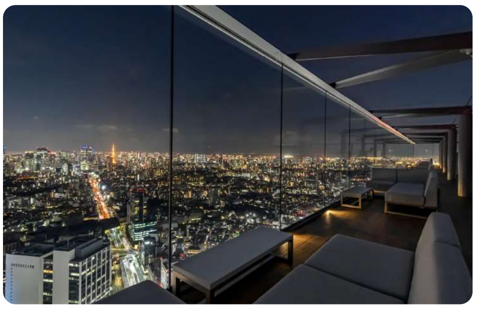
Photograph: The Roof Shibuya Sky

The view The rooftop of Shibuya Scramble Square is home to the Shibuya Sky observation deck. At 230 metres above ground, The Roof bar has breathtaking 360-degree views of Japan's capital city. Time Out Tokyo's Associate Editor Kaila Imada says the bar has vistas of all of Tokyo's major landmarks, such as Tokyo Tower and Tokyo Skytree, and on a clear day, Mt Fuji in the distance. Visit ahead of sunset to see the view in daylight and at twilight.