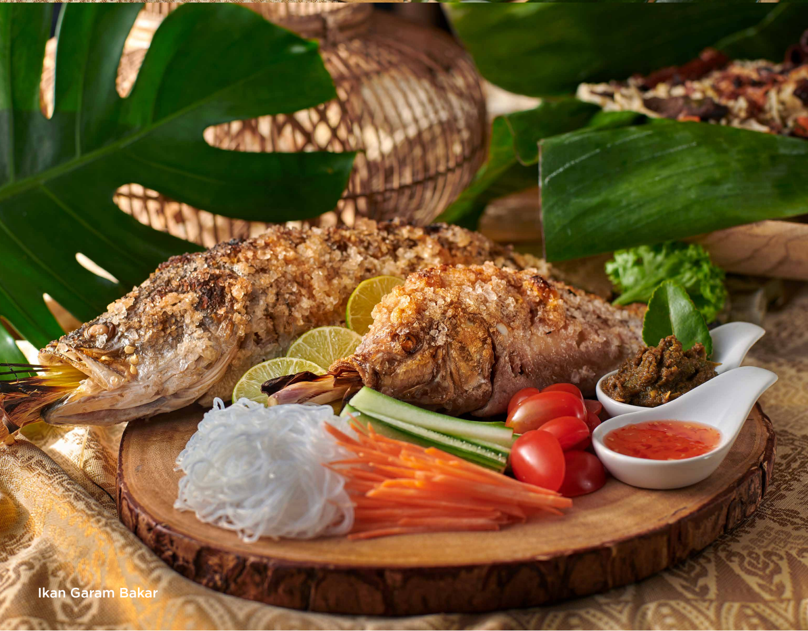
Ikan Garam Bakar