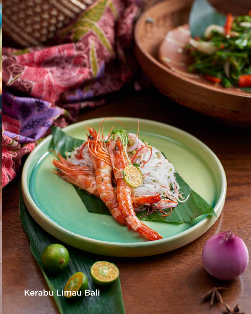
Kerabu Limau Bali