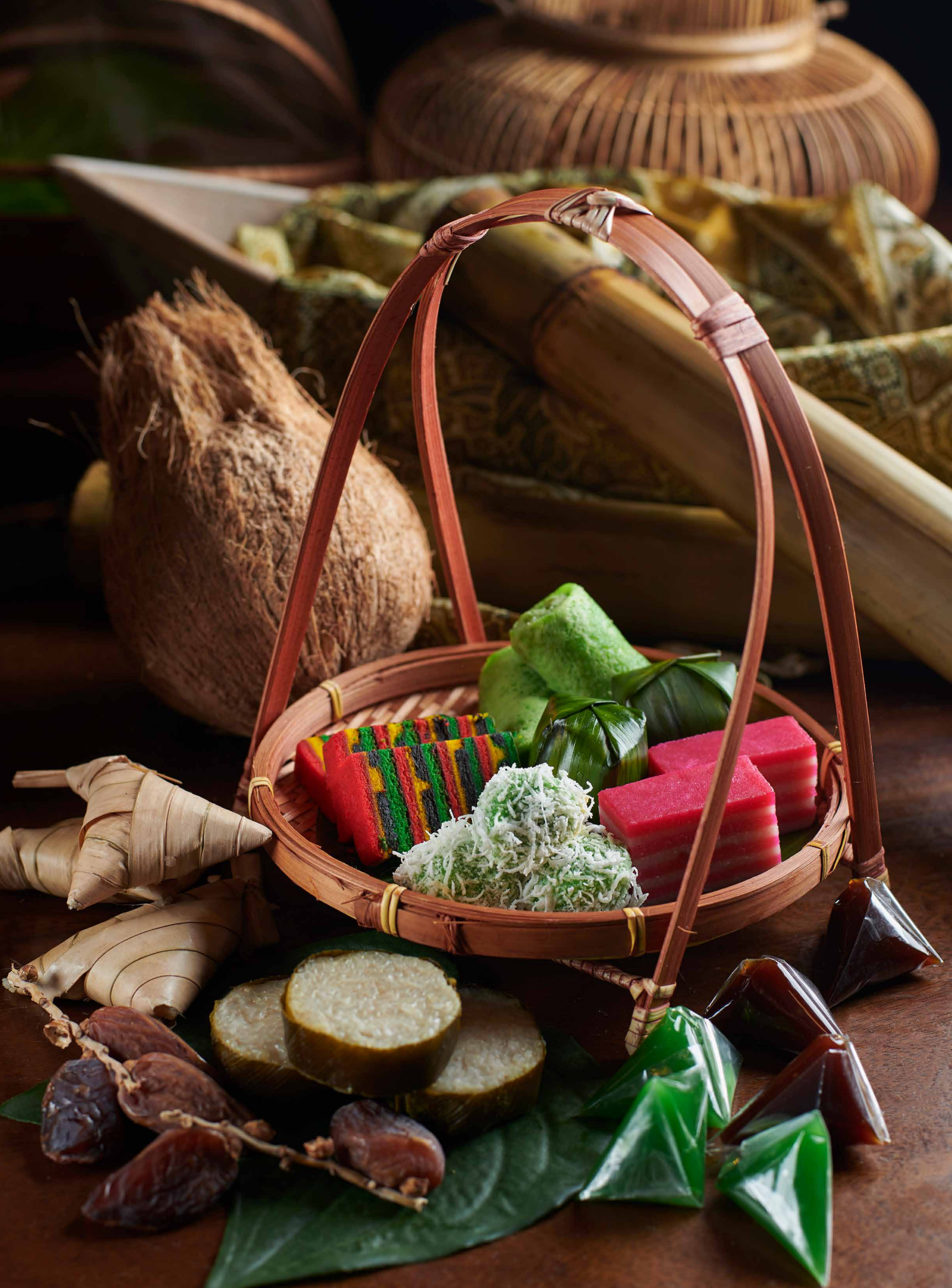
Hidangan Raya dan Pencuci Mulut