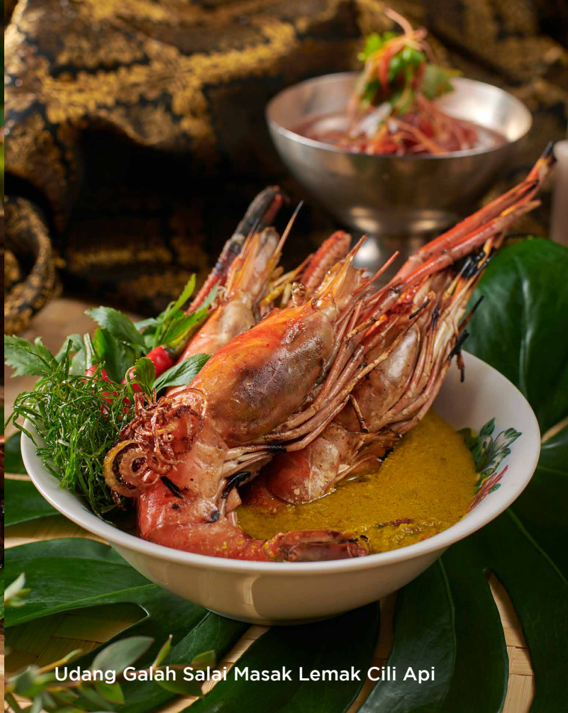
Udang Galah Salai Masak Lemak Cili Api