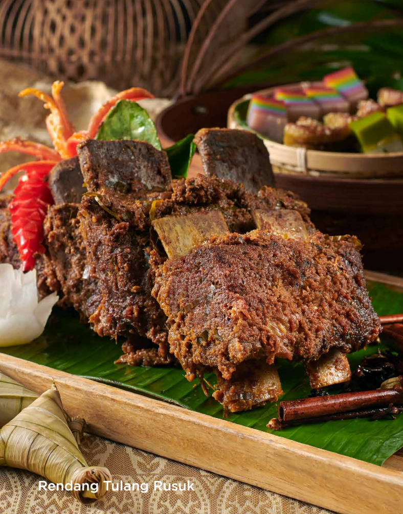
Rendang Tulang Rusuk