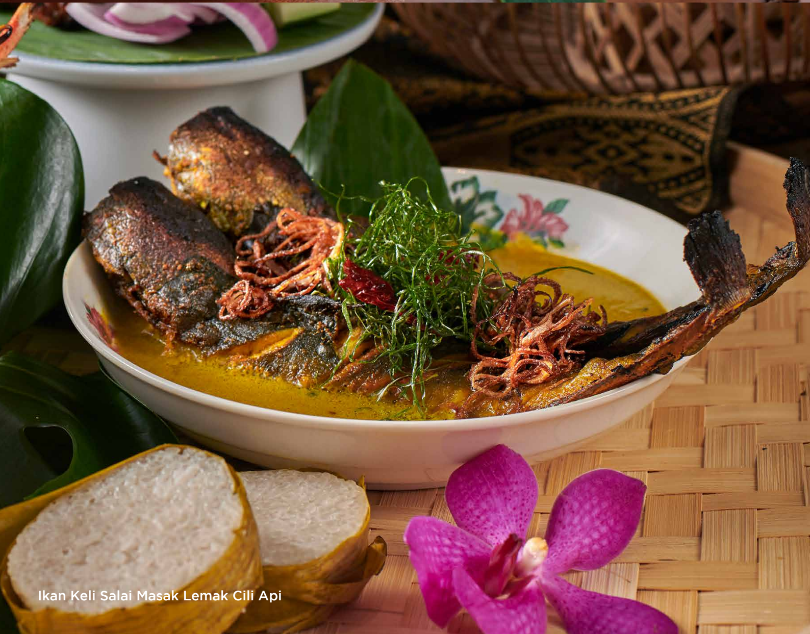
Ikan Keli Salai Masak Lemak Cili Api